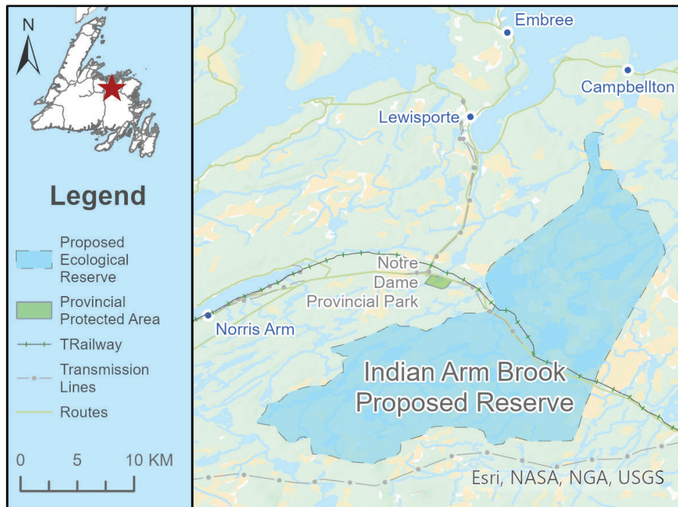
Figure 1. Map of Indian Arm Brook Proposed Ecological Reserve.

The Government of Newfoundland and Labrador reviews WERAC's recommendations and decides if a proposed ecological reserve should receive temporary protection during comprehensive public consultations. If the provincial government decides to establish Indian Arm Brook as a provisional ecological reserve, there will be more detailed public involvement while the area is safeguarded from large-scale developments. Alternatively, if the area is not established as a provisional reserve, it will be reopened for commercial harvest.