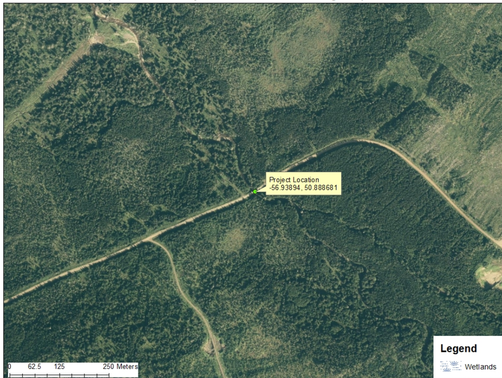
Squid Cove Forestry Access Road 2.7km - Bridge Replacement