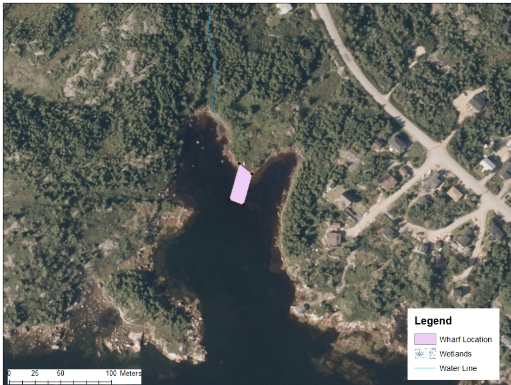
Business Cove - Wharf Construction