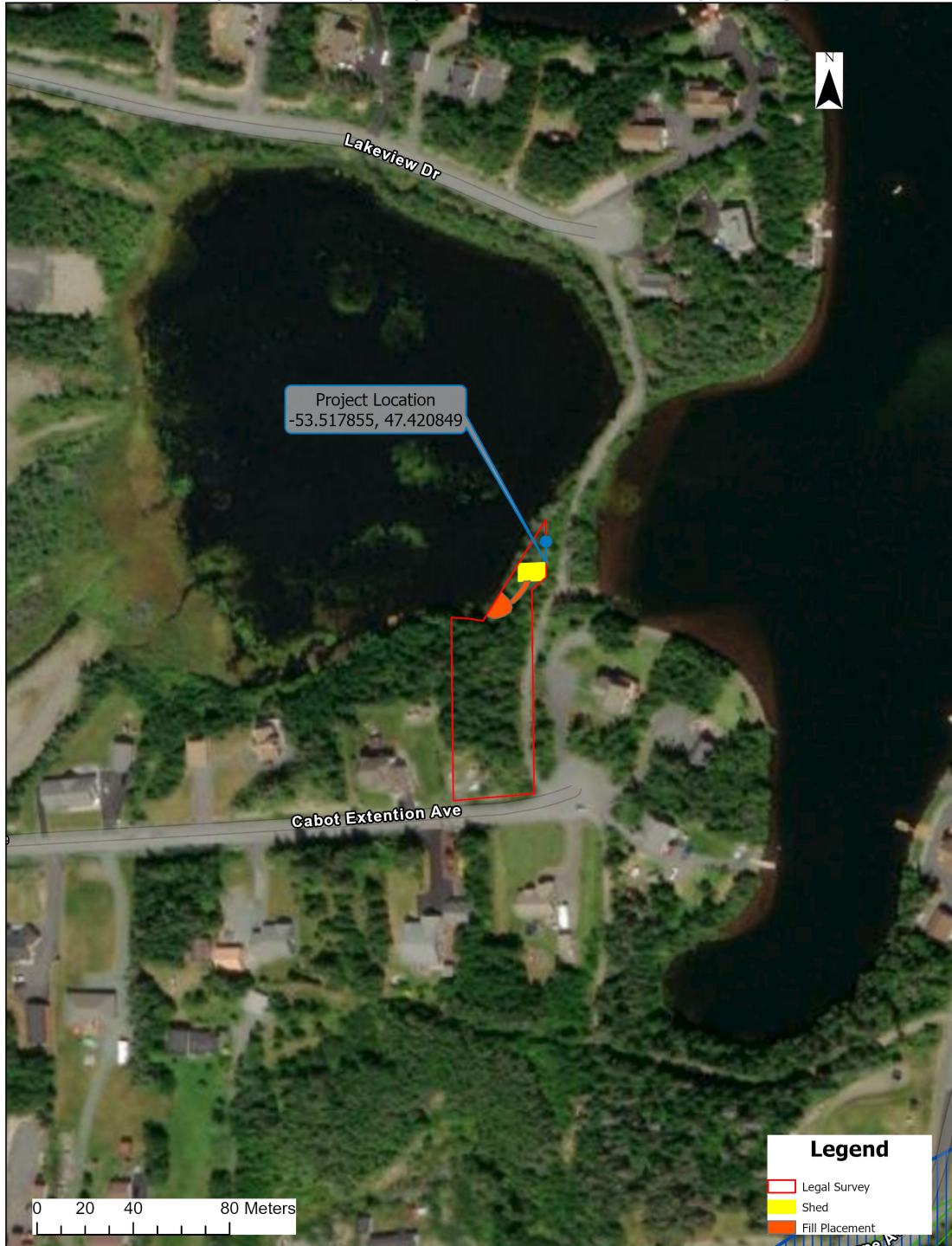
Town of Whitbourne (Williams Gully Pond) - Placement of an Accessory Building and Fill Material