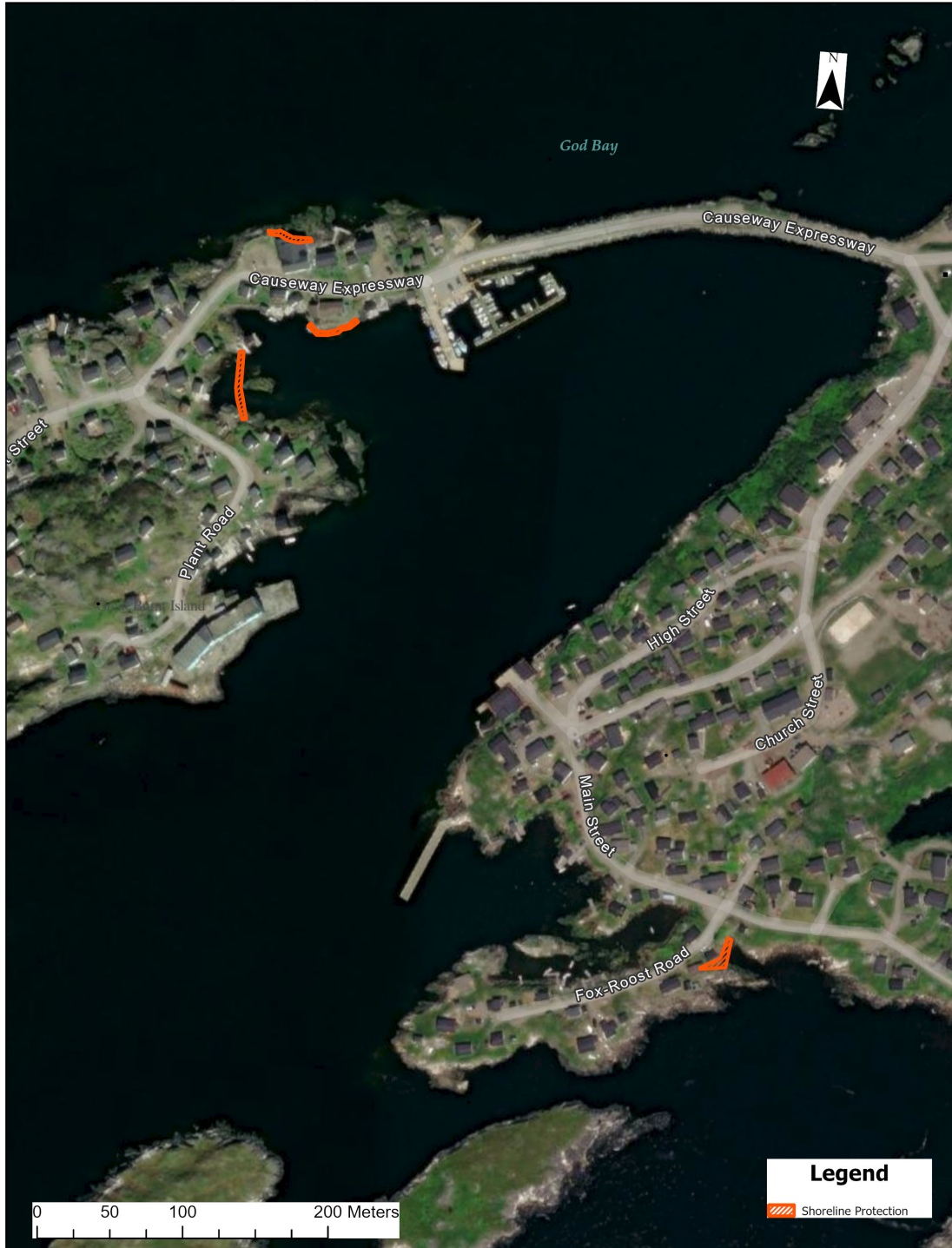
Town of Burnt Islands (God Bay) - Hurricane Fiona Restoration - Shoreline Protection Reinstatement