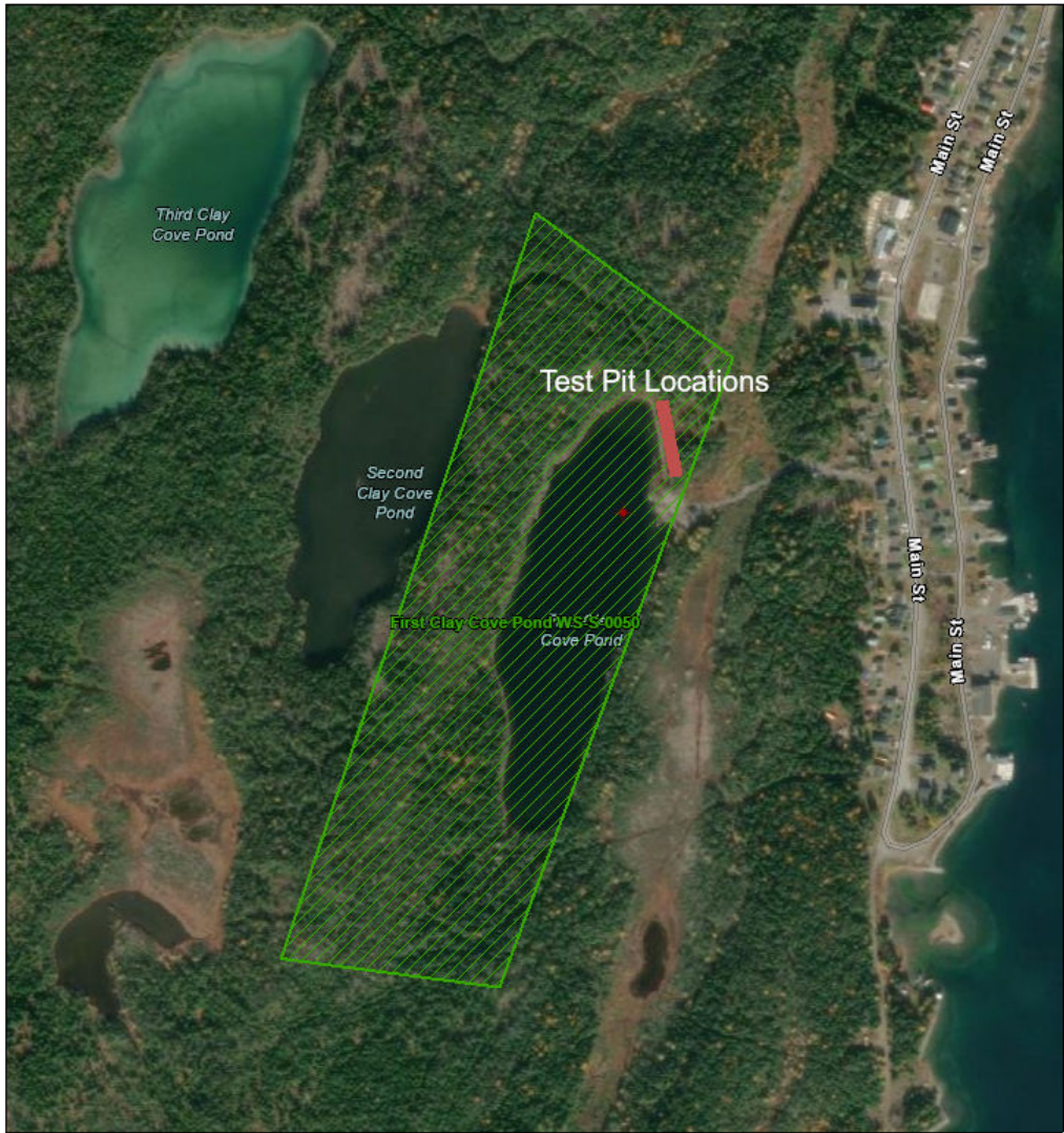
ALT13959-2024 First Clay Cove Pond PPWSA