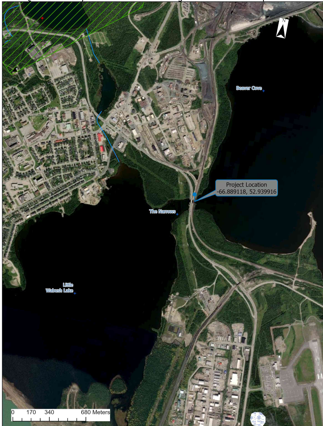
QNS&L Railway - Wabush Lake Crossing - Tie and Ballast Replacement