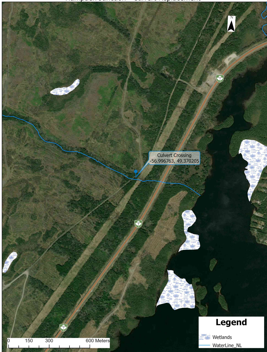
Hampden Junction - Culvert Replacement