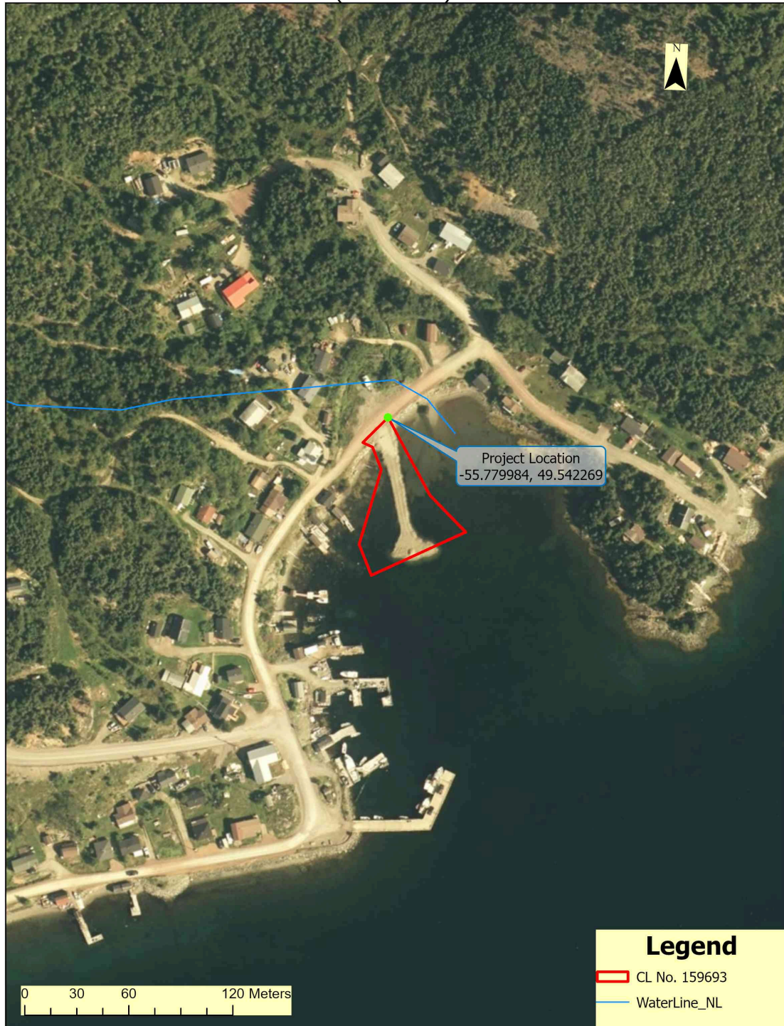
Town of Miles Cove (Miles Cove) - Small Craft Marina