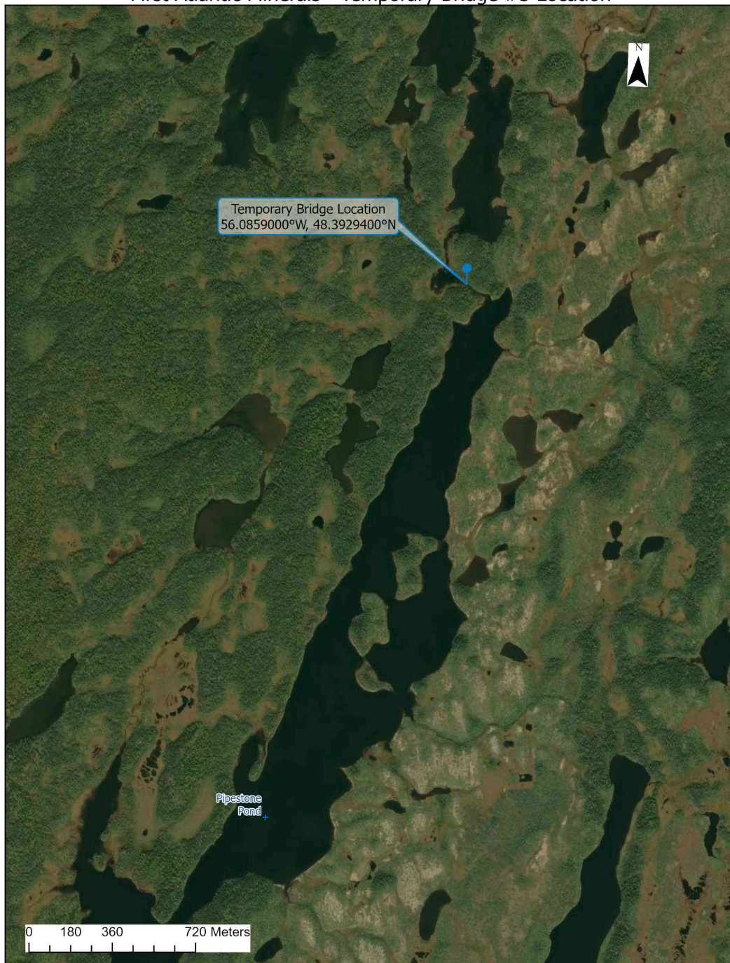
First Atlantic Minerals - Temporary Bridge #5 Location