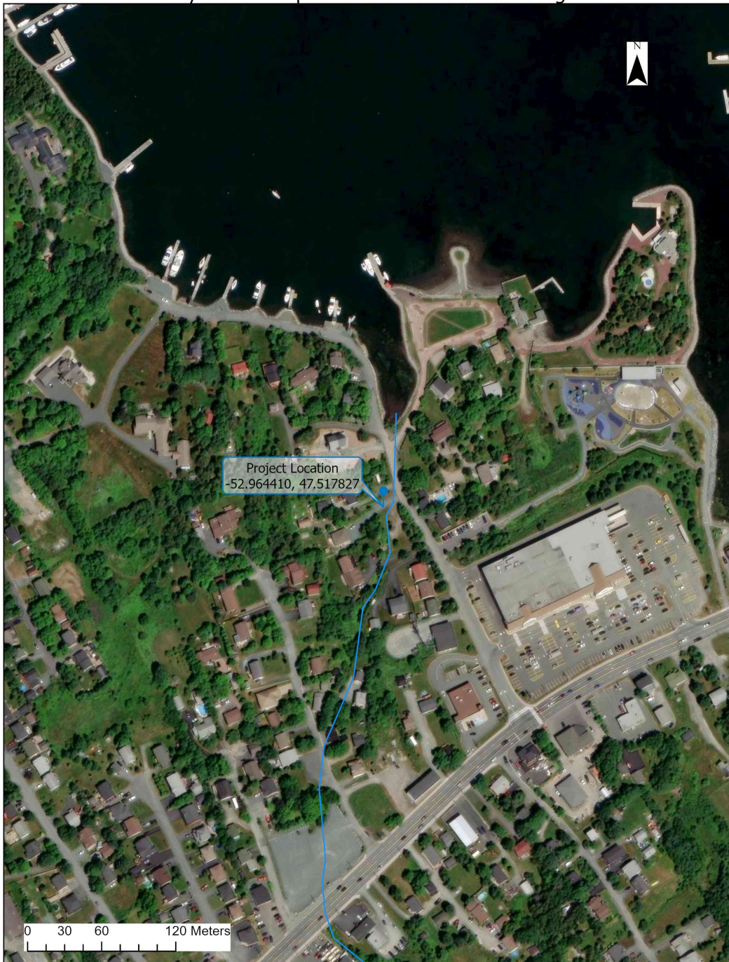
Driveway Culvert Replacement and Channel Realignment