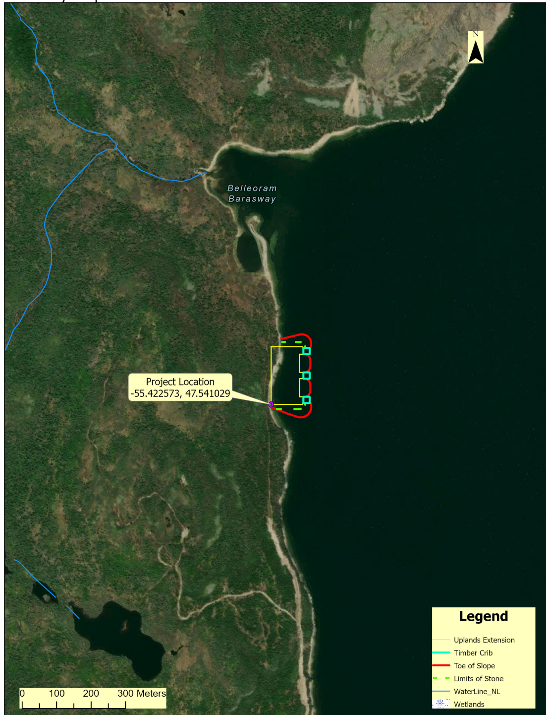
Belle Bay - Uplands Extension & Wharf Construction 550m North of Belleoram