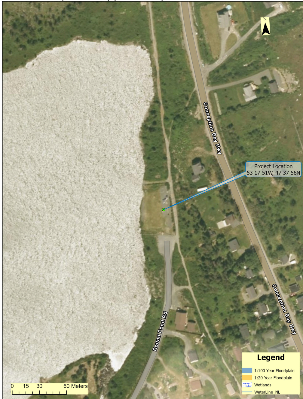
Town of Spaniard's Bay (Round Pond) - Fill Placement for Pond Access