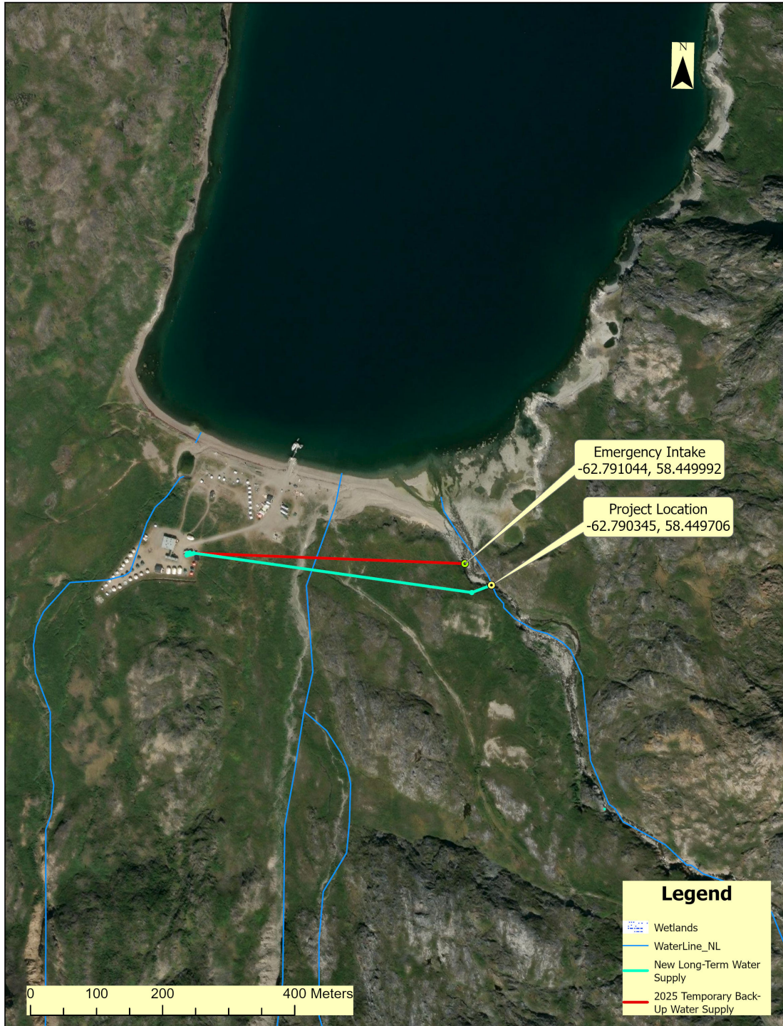
Unnamed Waterbody - Torngat Mountain Base Camp Infrastructure Upgrades 2025 - Water Intake