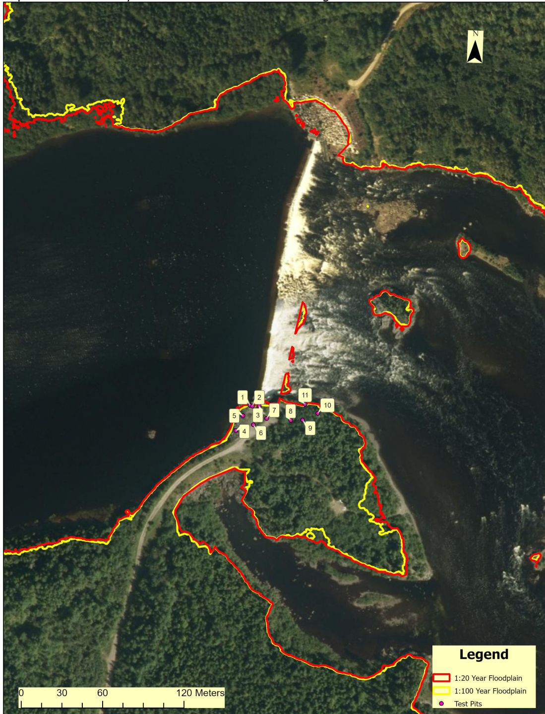
Exploits River - Goodyear's Dam - Geotechnical Investigation for Salmon Ladder Construction