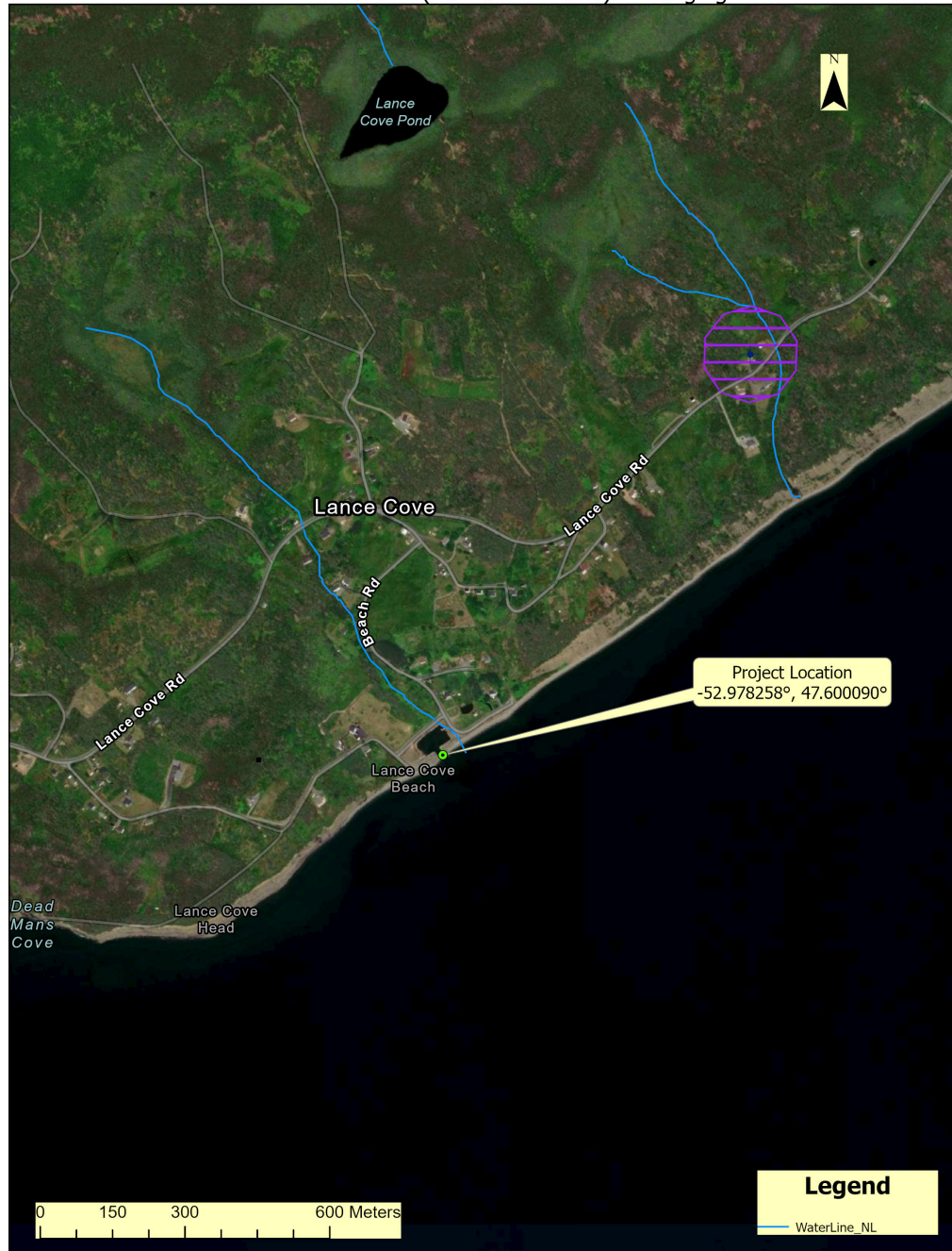
Town of Wabana (Bell Island Tickle) - Dredging