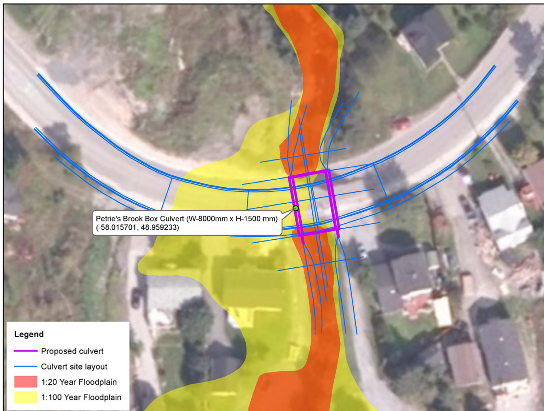
Replacement of Petrie's Brook Culvert in Corner Brook