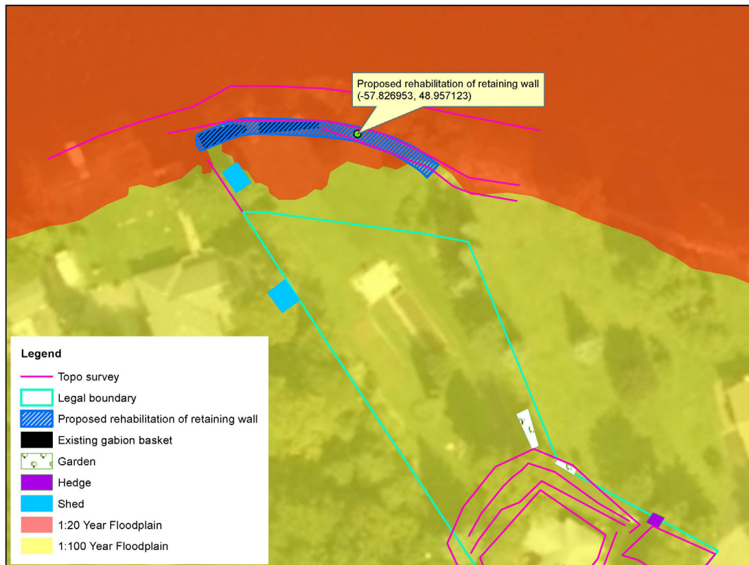
Rehabilitation of an existing retaining wall at 4 Forest Drive, Steady Brook