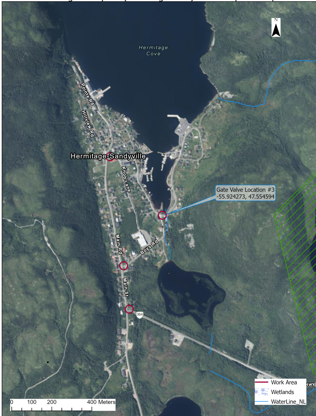
Town of Hermitage-Sandyville (Hermitage Cove) - Water System Improvements