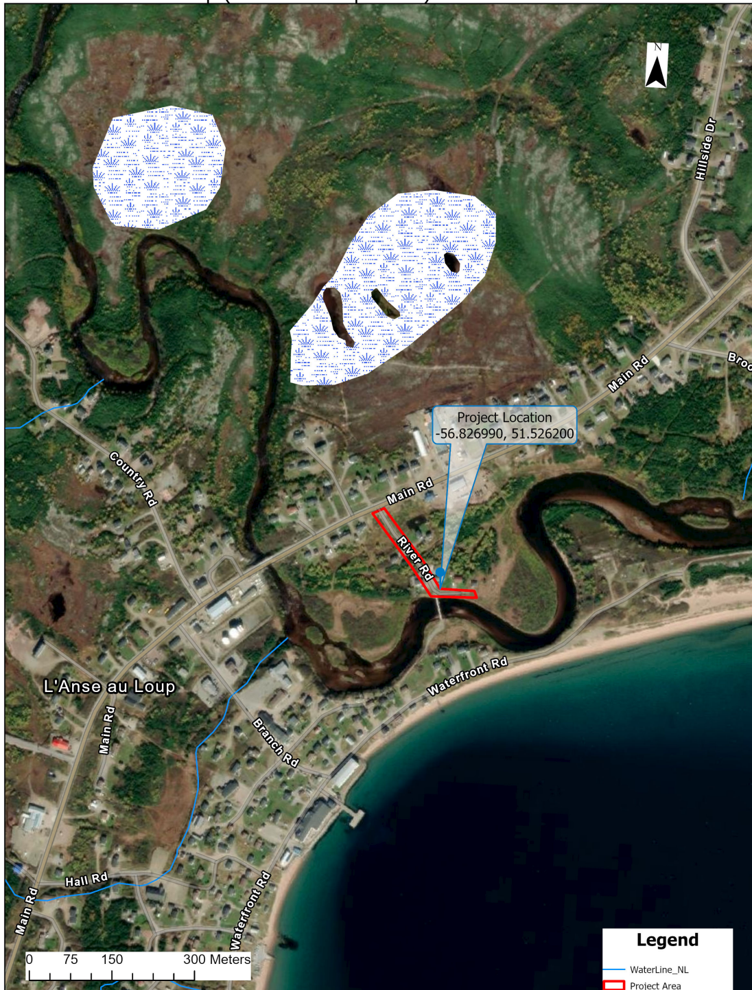
Town of L'Anse au Loup (L'Anse au Loop Brook) - River Road Watermain Installation