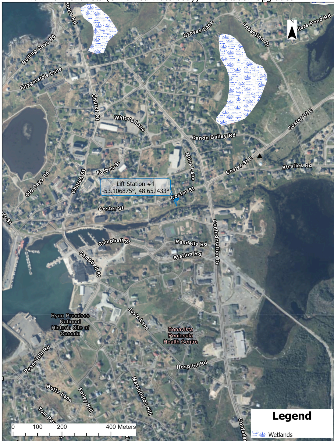
Town of Bonavista (Unnamed Waterbody) - Lift Station Upgrades