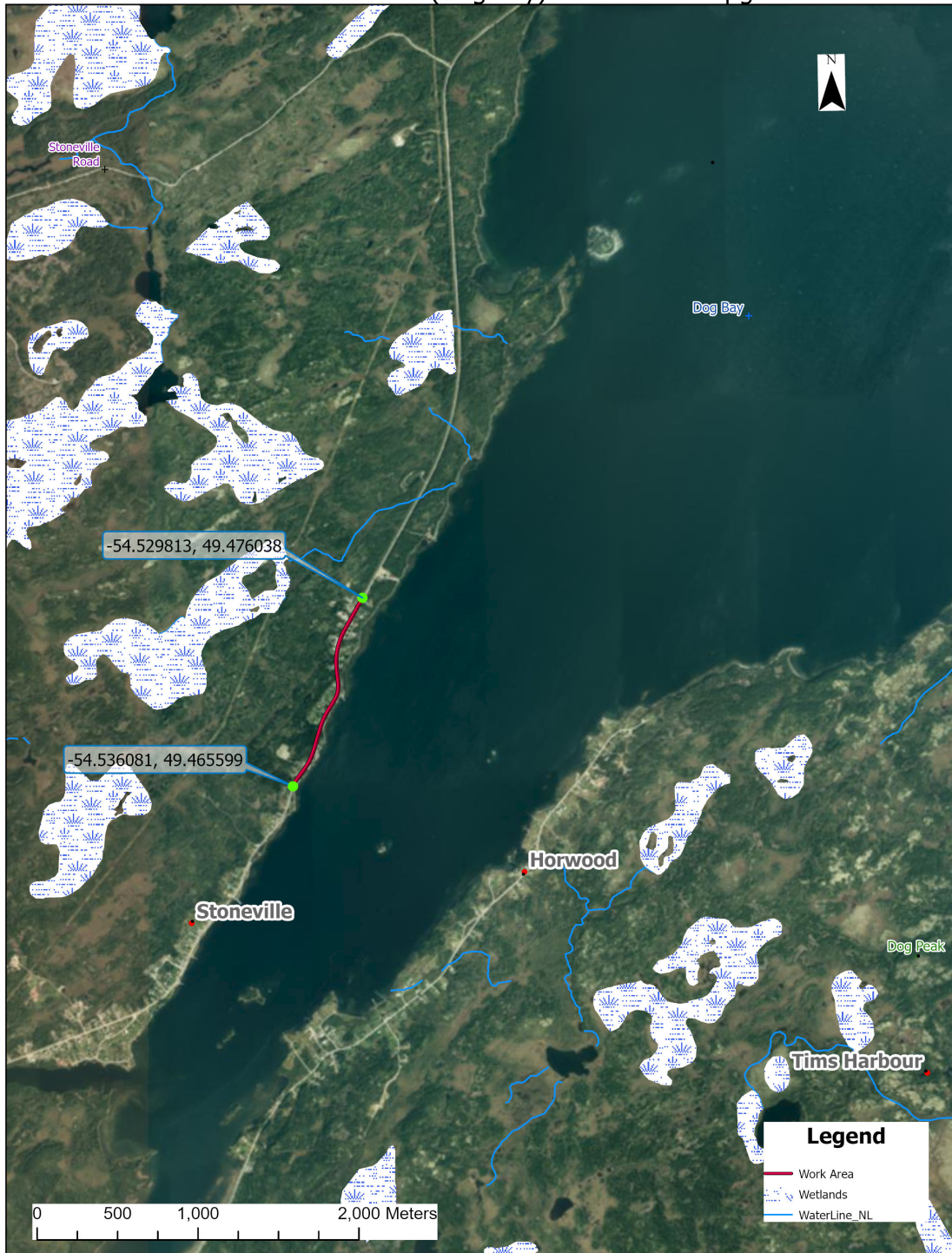
Town of Stoneville (Dog Bay) - Watermain Upgrades