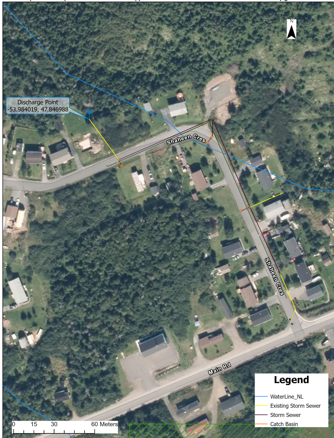
Come By Chance (Unnamed Waterbody) - Shaheen Crescent Water and Sewer Upgrades Phase 2