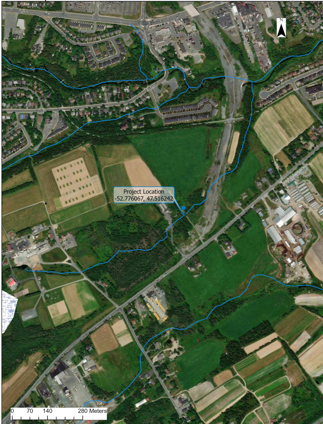
City of St. John's - Brookfield Road Water Transmission Relocation