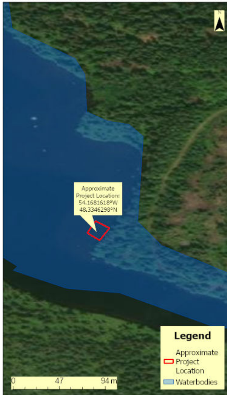
Port Blandford (Noseworthy's Pond) - Water Intake