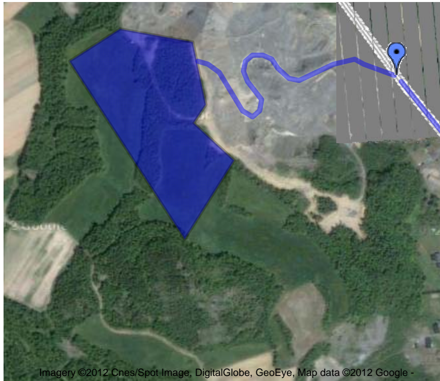
A & B Brown's Arm Pit (Quarry Request)