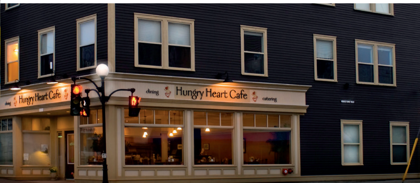
Hungry Heart Cafe - St. John's

The community sector is central to social and economic progress in Newfoundland and Labrador. The sector's role in social development in the province is well-documented and understood. However, the same cannot be said for the economic contributions of the community sector. At the outset of this process, four hypotheses about the community sector's importance in economic terms were developed: