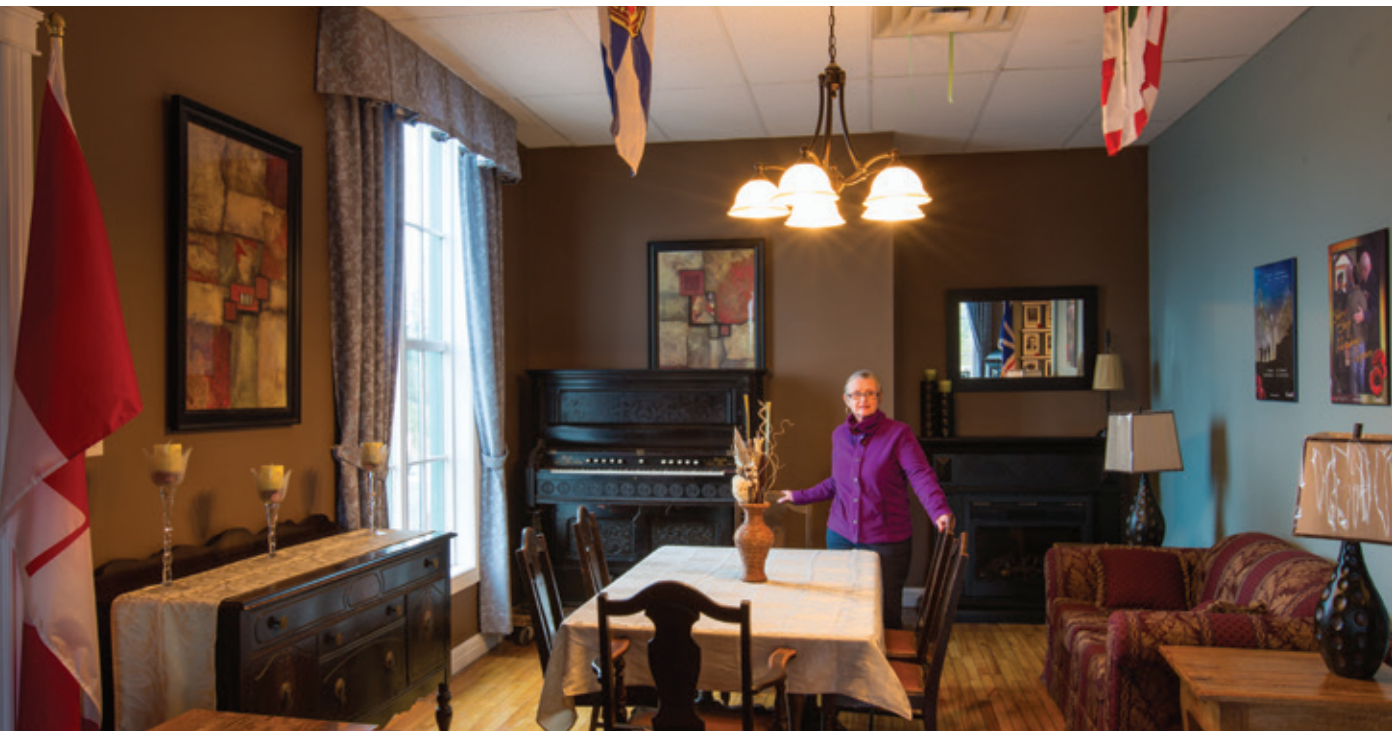
St. Gabriel's Hall

Together, community organizations, post-secondary institutions and the Provincial Government, with input from federal representatives, have identified key challenges and opportunities related to the economic contributions of the community sector. We will work together to deliver better services for community organizations, to address issues related to human resources and demographics, to raise awareness and increase public appreciation of the work of the community sector, and to improve partnerships and collaboration within the sector and with the public and private sectors. What follows are the actions we will take together to accelerate growth in the community sector in Newfoundland and Labrador.